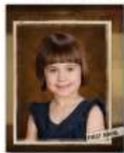
8x10 Gold Linen Order Code GL