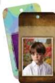
3 key fobs