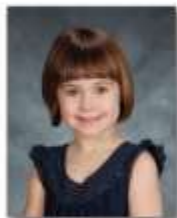
8x10 Traditional No borders or personalization Order Code TT