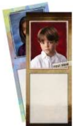
4x10 locker magnet