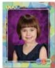
8x10 Point Order Code PT