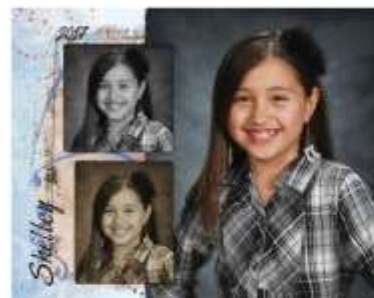
8x10 custom art print