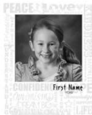
word art print