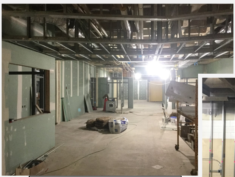
Walls were filled with insulation and closed up with drywall. Now mudding and taping the joints before paint