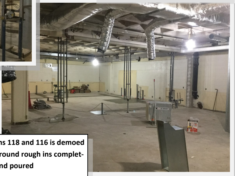
Wall Between Rooms 118 and 116 is demoed complete. MEP in ground rough ins completed and poured