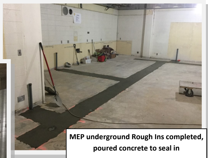
MEP underground Rough Ins completed, poured concrete to seal in