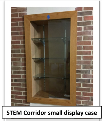
STEM Corridor small display case