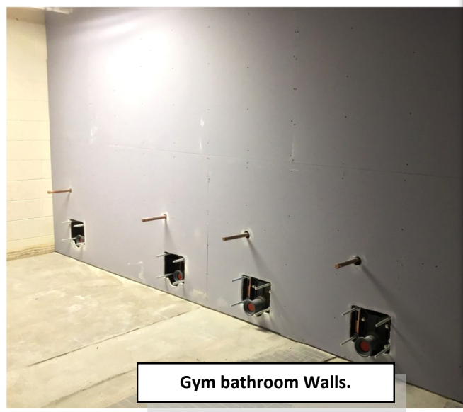
Gym bathroom Walls.