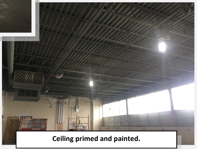
Ceiling primed and painted.