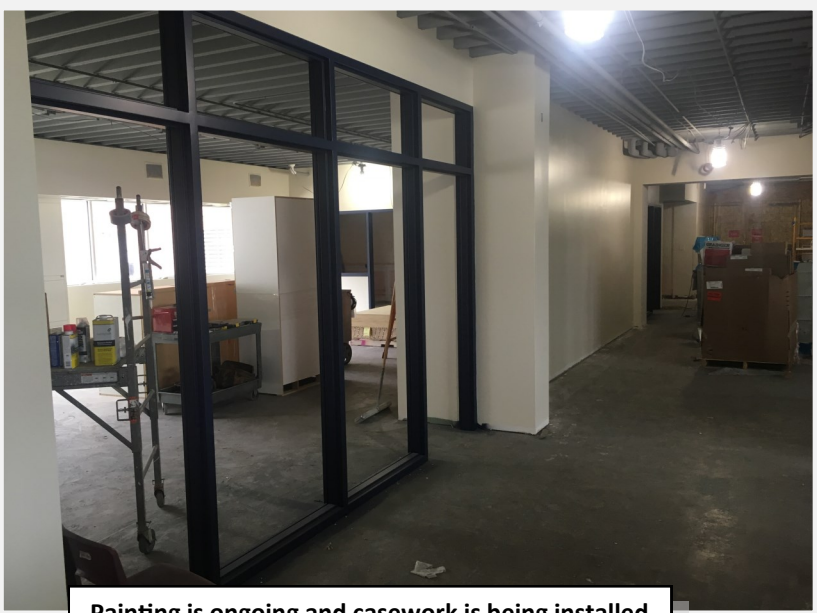
Painting is ongoing and casework is being installed