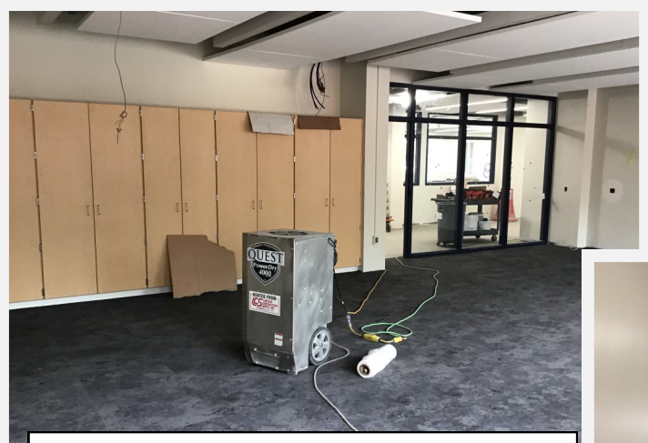
Business Classroom cabinets and Carpet tile