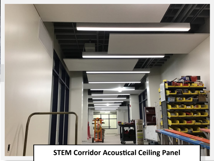
STEM Corridor Acoustical Ceiling Panel