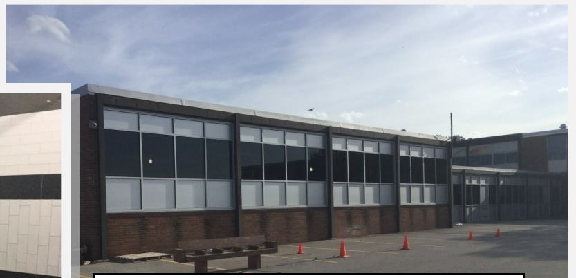
Window Storefront System is completed on the North side of the Tech Ed Wing