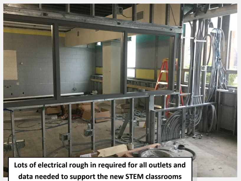
Lots of electrical rough in required for all outlets and data needed to support the new STEM classrooms