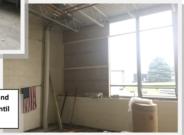
Storefront Glass System is being removed and temporary partitions going up in its place until framing and glass are installed