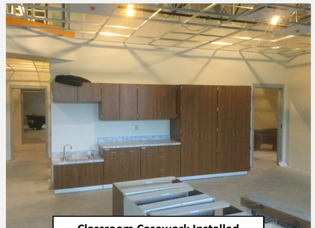
Classroom Casework Installed