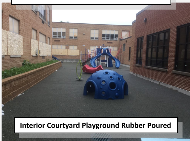
Interior Courtyard Playground Rubber Poured