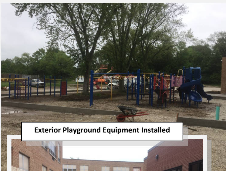
Exterior Playground Equipment Installed