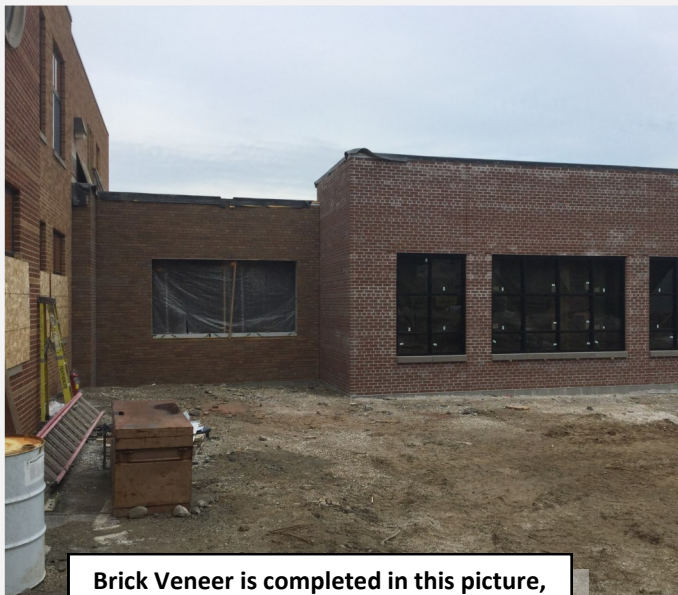
Brick Veneer is completed in this picture, windows are installed for one room in this picture