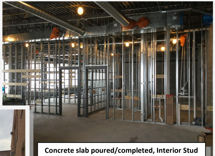
Concrete slab poured/completed, Interior Stud Walls completed, and Mechanical/Electrical/Plumbing (MEP) In wall rough in ongoing