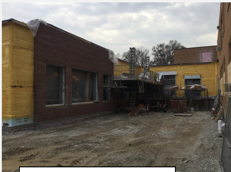
Exterior Spray Foam and Brick Veneer