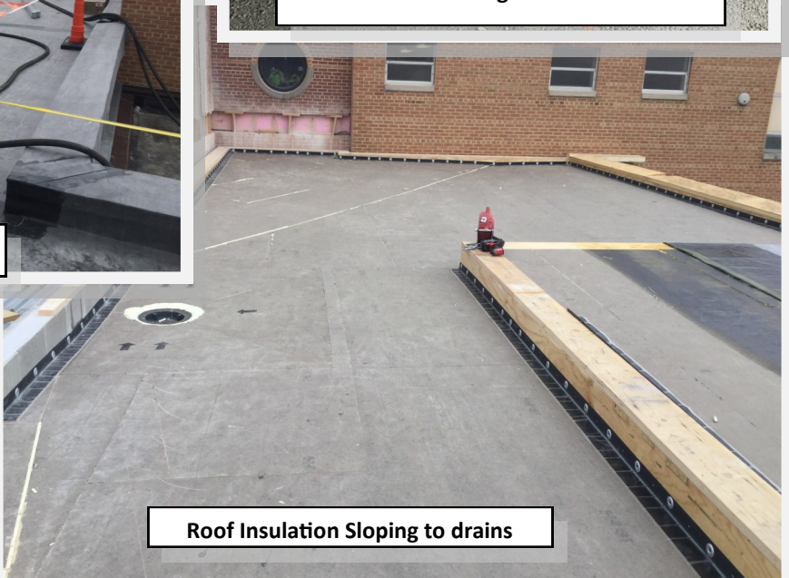
Roof Insulation Sloping to drains