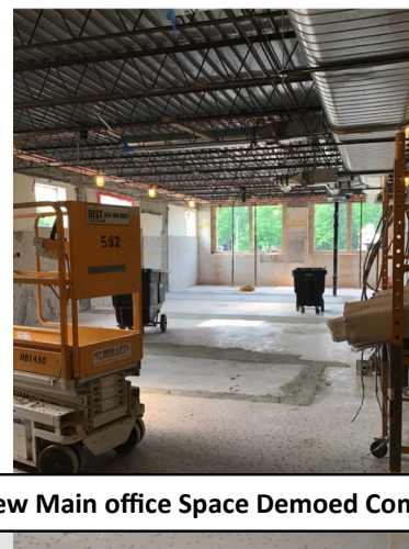
New Main office Space Demold Complete