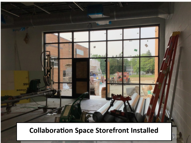
Collaboration Space Storefront Installed