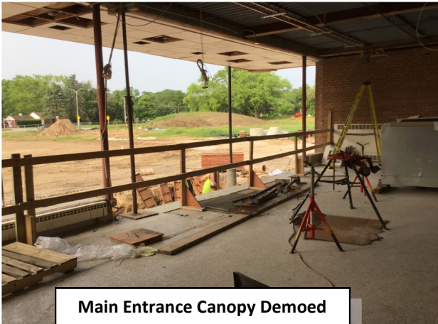
Main Entrance Canopy Demold