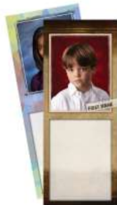
4x10 locker magnet