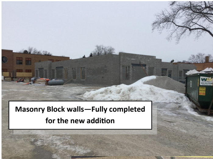
Masonry Block walls—Fully completed for the new addition