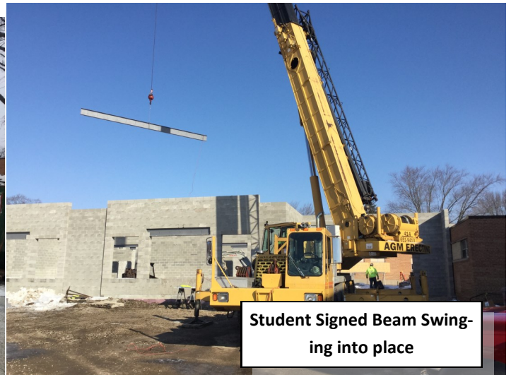
Student Signed Beam Swinging into place