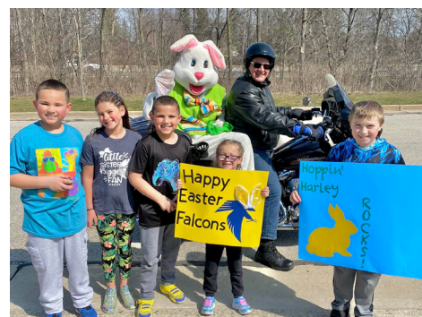
Hoppin' Harley on April 7

Each and every day, our employees demonstrate what it means to be all in, and that deserves some applause. At the start of 2023, we introduced All In Applause, which asks Whitnall staff, parents, students, or community members to nominate our employees for online recognition. Each recognition is shared on social media and in our digital staff and family newsletters. In our last issue of the Whitnall Window, we shared the first four All In Applause recipients, including their actual nominations. In this issue, we would like to share the sixteen staff members who have received All In Applause since then. You can head to our Facebook, Twitter, or website to see the full nominations and future recipients. Join us in giving each of these Whitnall employees a round of All In Applause, and please consider nominating a Whitnall employee. The nomination form is available on social media and on our website.