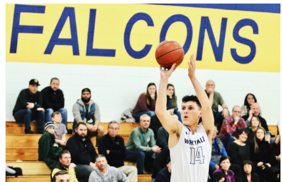
Pictured: Tyler Herro